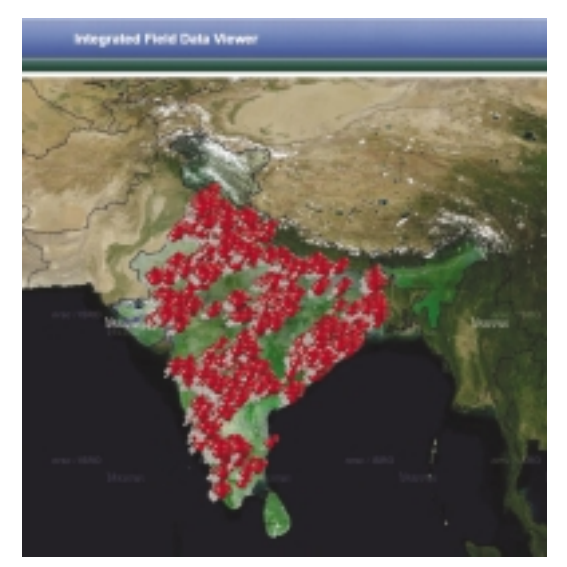
Figure 3. Crop Cutting Experiments data uploaded to ISRO's Bhuvan platform

Analysis of this data has shown that CCE planning using remote sensing based indices is statistically efficient and hence it would optimize the number of CCE. Based on the success of these studies, the Karnataka state government used this approach for operational CCE planning during the monsoon season of 2016 and the Odisha state government used this approach, for rice crop, during the rainy season of 2017.