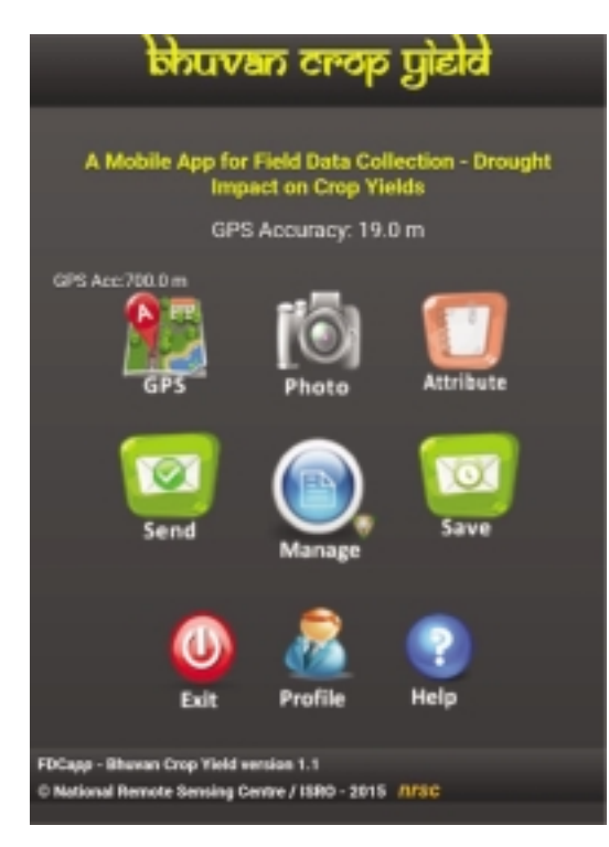
Figure 2. Android app being used for CCE data collection using smartphones, developed by NRSC, ISRO

The National Remote Sensing Centre, ISRO, has developed an Android app for collecting CCE data, along with geographic location and field photographs (Figure 2).